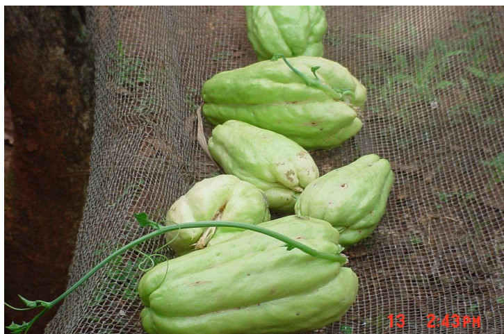
Chayote plants and fruits

Average leaf length (16.8 cm) and relatively edible tender fruit weighed in average 330 g, and width and length 25.88 and 15.53 cm respectively.